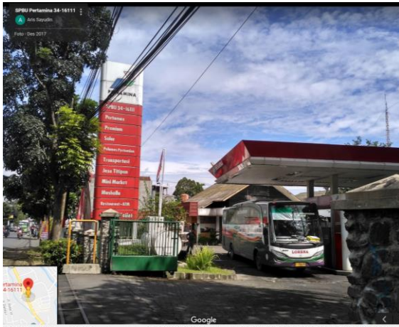
Pertamina Gasoline Stand (SPBU)